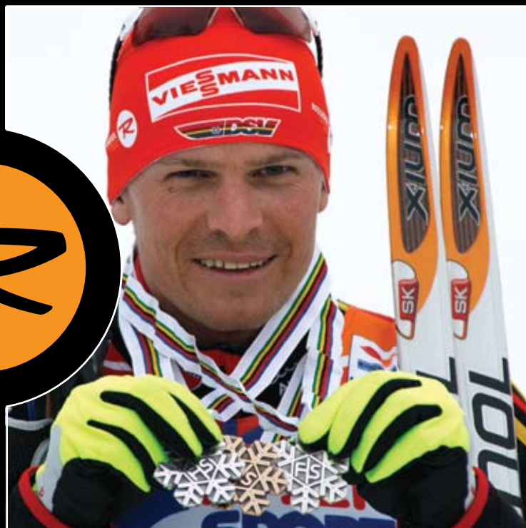
Tobias Angerer GER:

3 Gold medals: 10 km C, Team Sprint and Relay | 1 Bronze: 15Km Pursuit